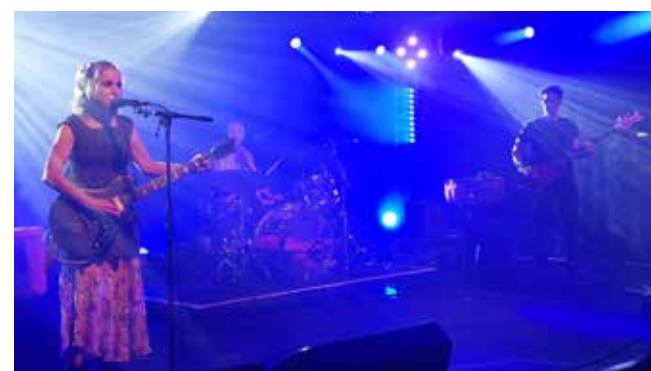
Kristin Hersh captivated her audience