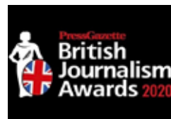
Winner of Innovation of the Year at the British Journalism Awards